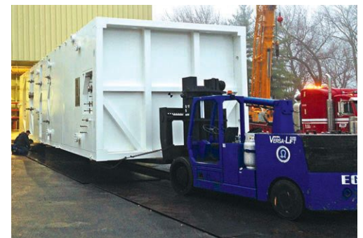
A cold box fabrication project leaves Hetsco's facility.